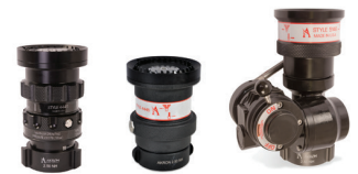
Style 4446 Nozzle