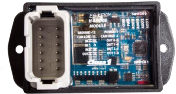
Figure 1: H-Bridge Module 610-00063/610-00063-001

AFFECTED PART NUMBER: 610-00063 AND 610-00063-001