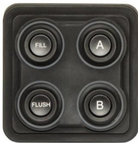
Figure 2: SmartTOUCH Controller 610-00062-000/610-00062-003

Hale is updating the EZ-Fill software to version 1.1, and all units in the field using an H-Bridge Module (Figure 1) will need to be updated to this latest version. Software release 1.1 sets the 3-way valve port to the tank to close position when not in use instead of in the open position. This prevents the foam tank from draining. The H-Bridge Module is only used with the newer SmartTOUCH controller (Figure 2), and not the recently discontinued switch (Figure 3).