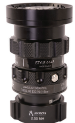
Style 4446 Nozzle