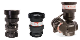
Style 4446 Nozzle