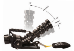
10° Low elevation