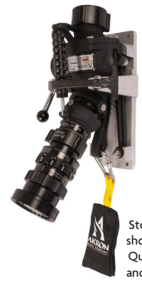
Storage Bracket shown with 3444 Quick Attack LE and 4446 Nozzle