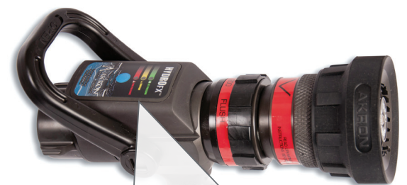
Style 1763FX Nozzle