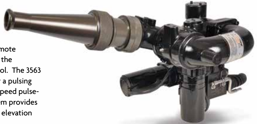
STYLE 3563 Shown with STYLE 489 Tip & 3485 Stream Shaper