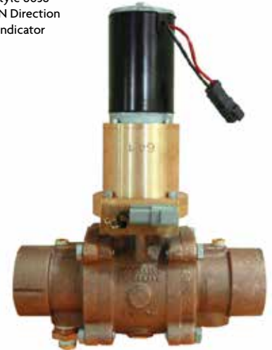
Optional high speed valve provides pulses between 1/2 second - 2 1/2 seconds in length or can be used in continuous mode.